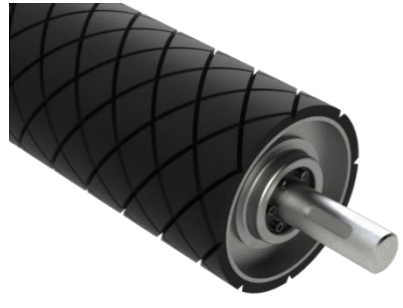
DRUM ROLLERS Page

AED Rollers Ltd. Unit 3, Albion Works, Moor Street, Brierley Hill, West Midlands, DY5 3SZ, UK.